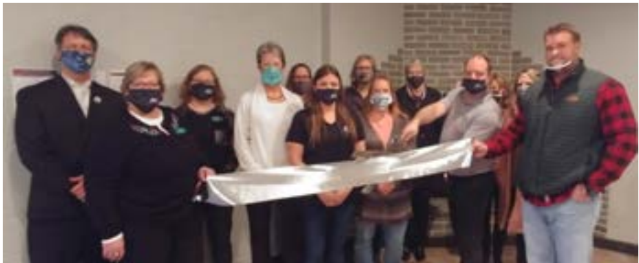
EXIT REALTY - GREAT PLAINS Chamber Ambassadors hold a ribbon cutting with Chamber member Exit Realty - Great Plains at their new location and remodel in Five Lakes Centre