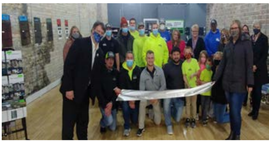
FAIRMONT ROOFING Chamber Ambassadors visited their new location on Downtown Plaza and checked out their remodel of another downtown building!