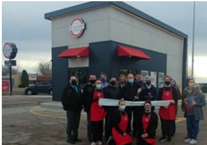
SCOOTER'S COFFEE Ambassadors celebrated with New Chamber member Scooter's Coffee during their Grand Opening which was held on December 11